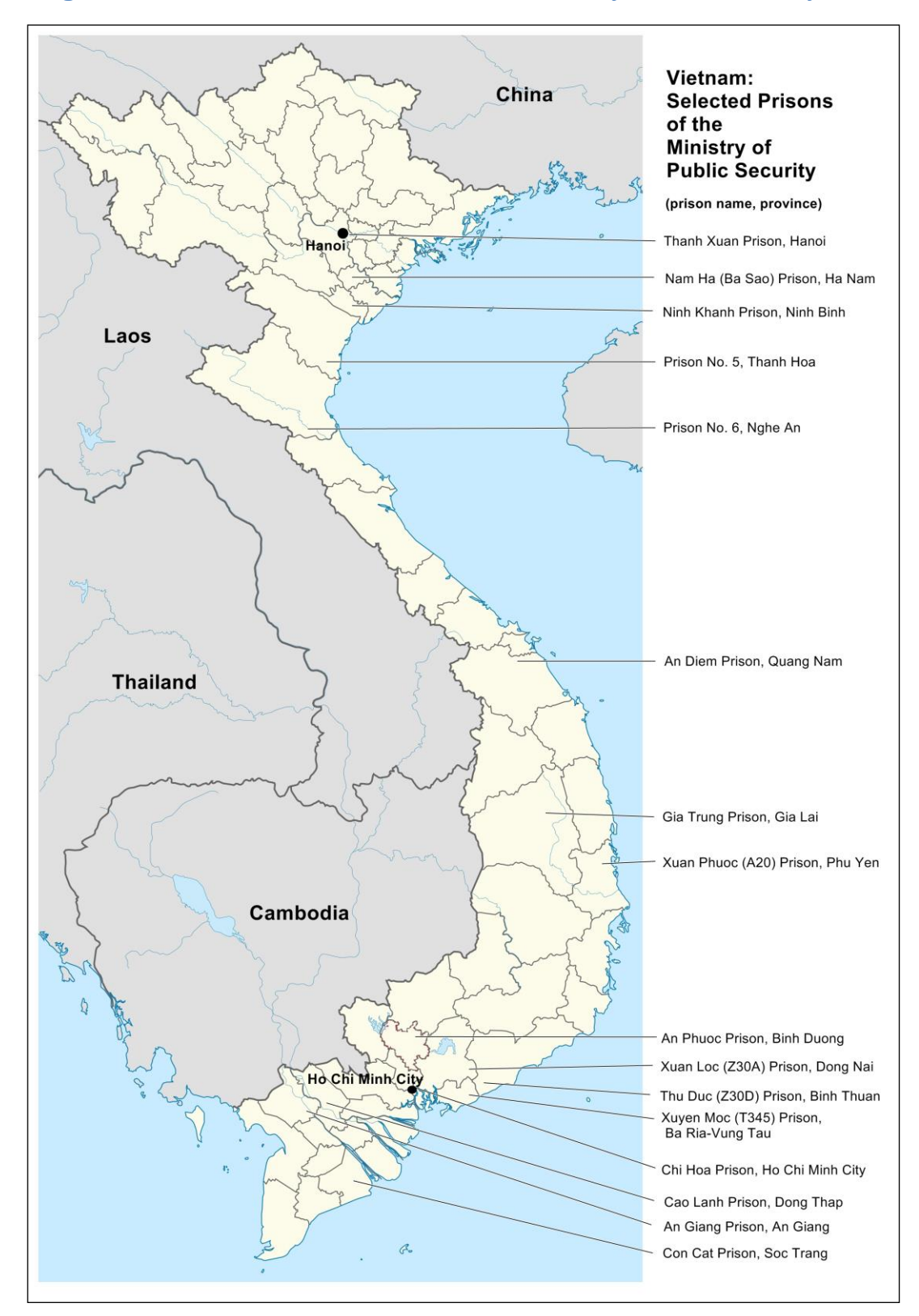
Figure 2: Locations of Selected Prisons of the Ministry of Public Security